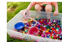
POM POM WATER PLAY